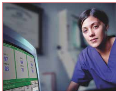
Figure 1. Oxinet ® (Covidien/Nellcor)

Unrecognized, decompensated, respiratory depression in the setting of postoperative opioid therapy is a significant contributor to in-hospital morbidity and mortality. The consensus statement from the APSF Workshop on the prevention of postoperative respiratory complications called for “zero tolerance” to patient harm due to postoperative opioids. Respiratory complications due to opioids are deemed preventable with better monitoring and awareness by clinicians.